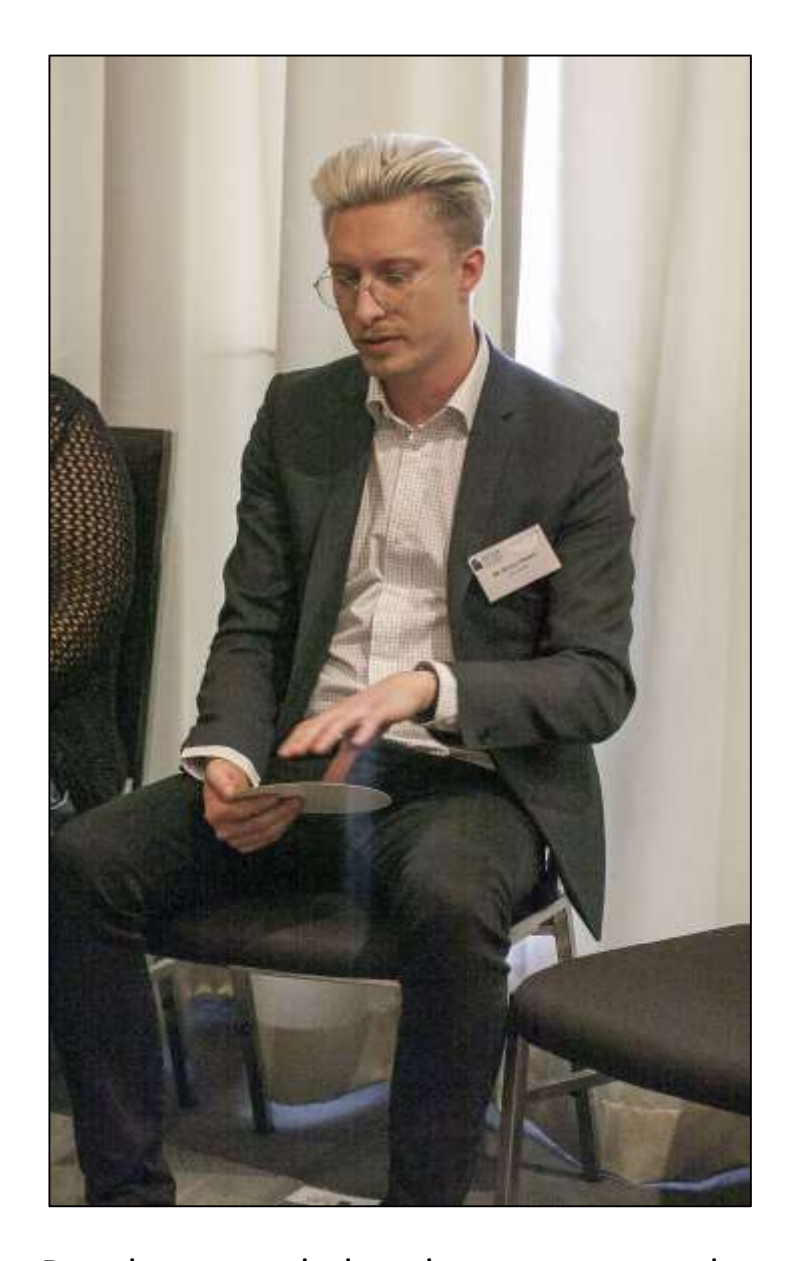
People responded to the messages and artworks and were moved by their power.