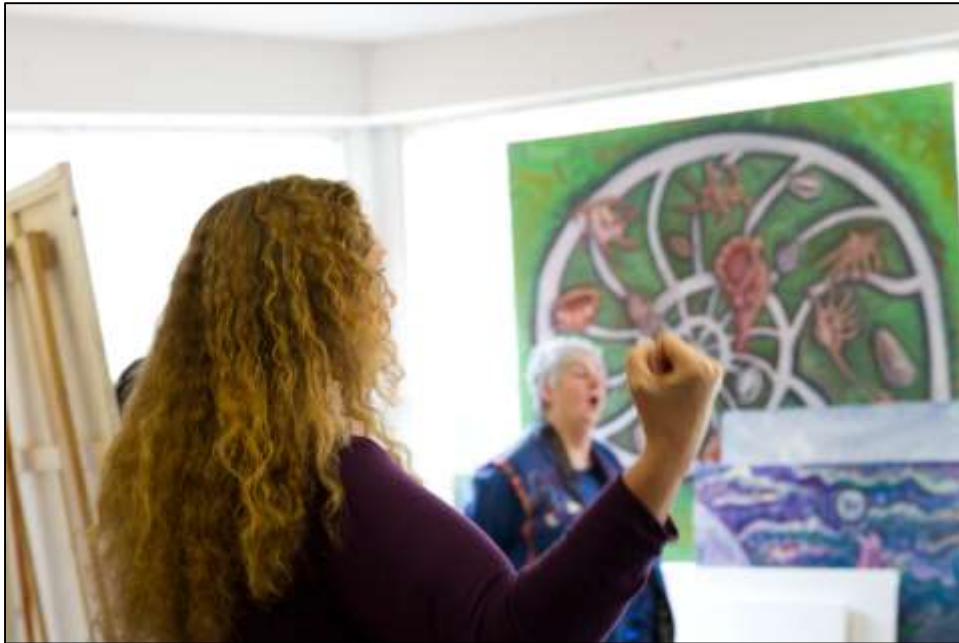
We danced together