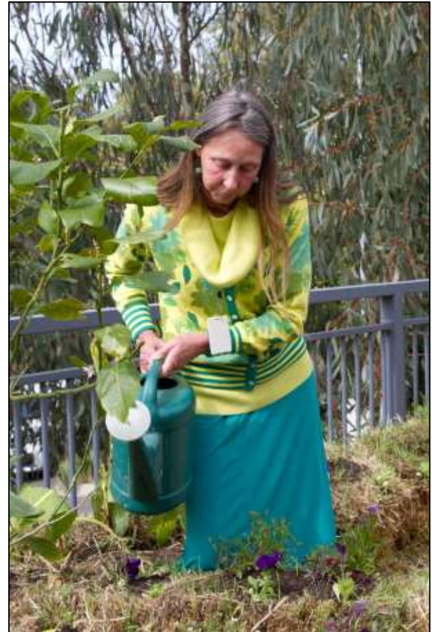
We lay the Burrinja Pigeon to rest in the Community Garden