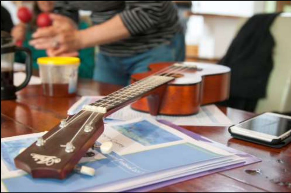
Cape Woolamai, Phillip Island House Concert and Creative Development Weekend 26 th and 27 th September 2015