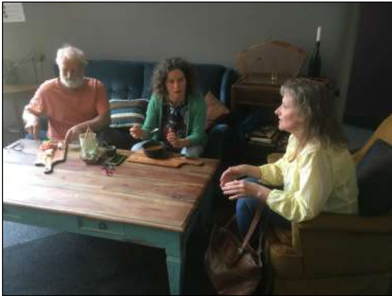
We shared food and conversation