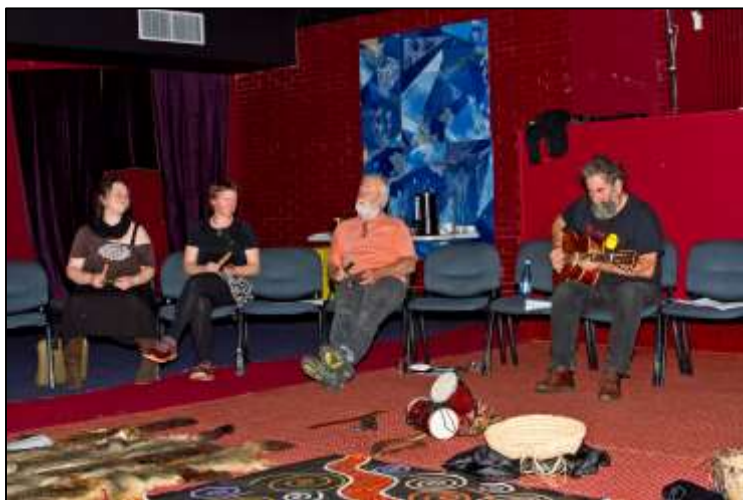
We learned from each other