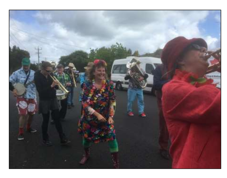
... and down the street