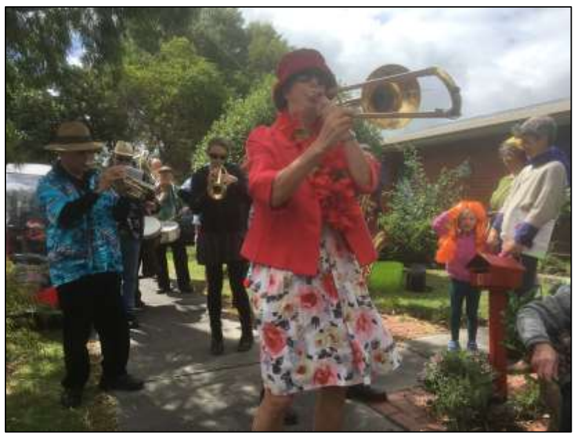
... and we all sang along