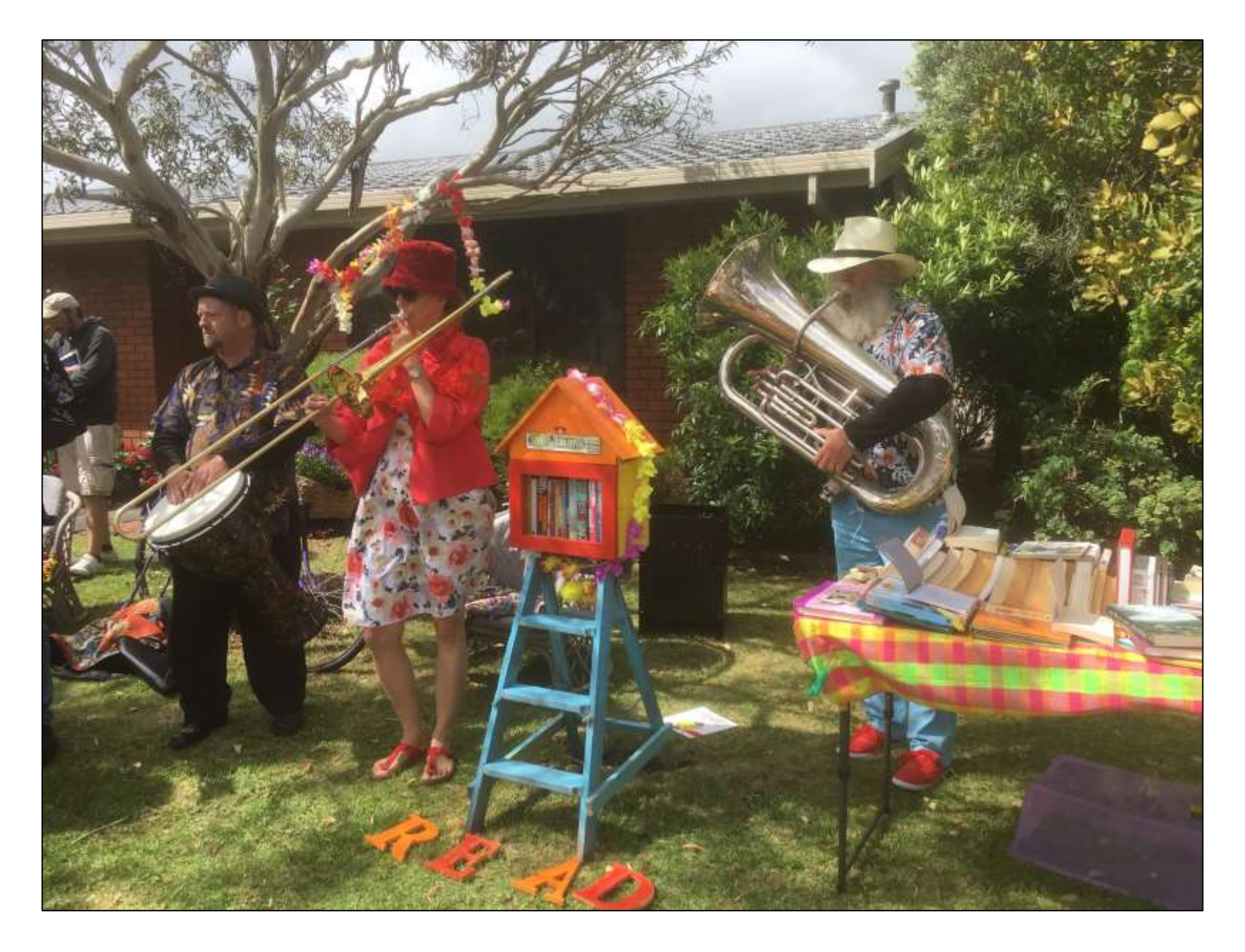
The Band played some songs in front of the Street Library ...