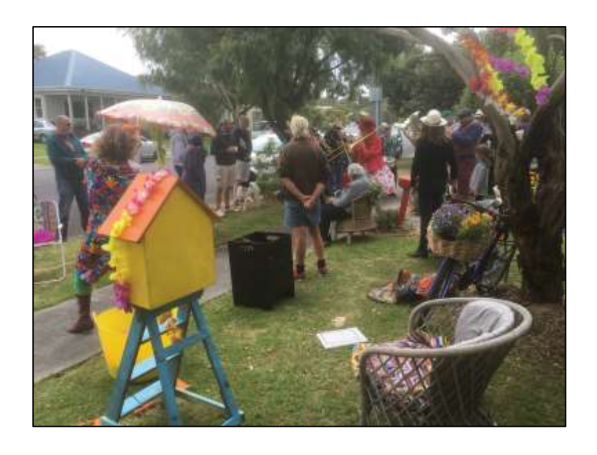
... and books were exchanged