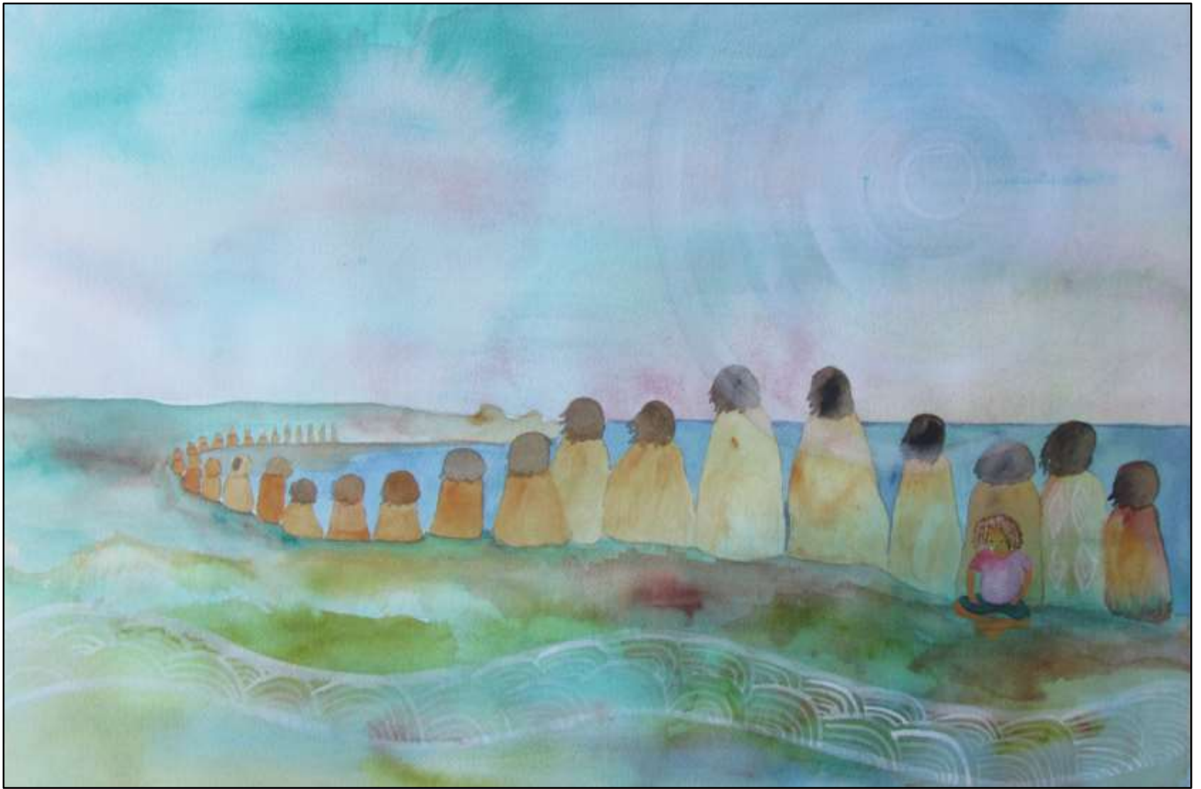
Festival Opening and Smoking Ceremony