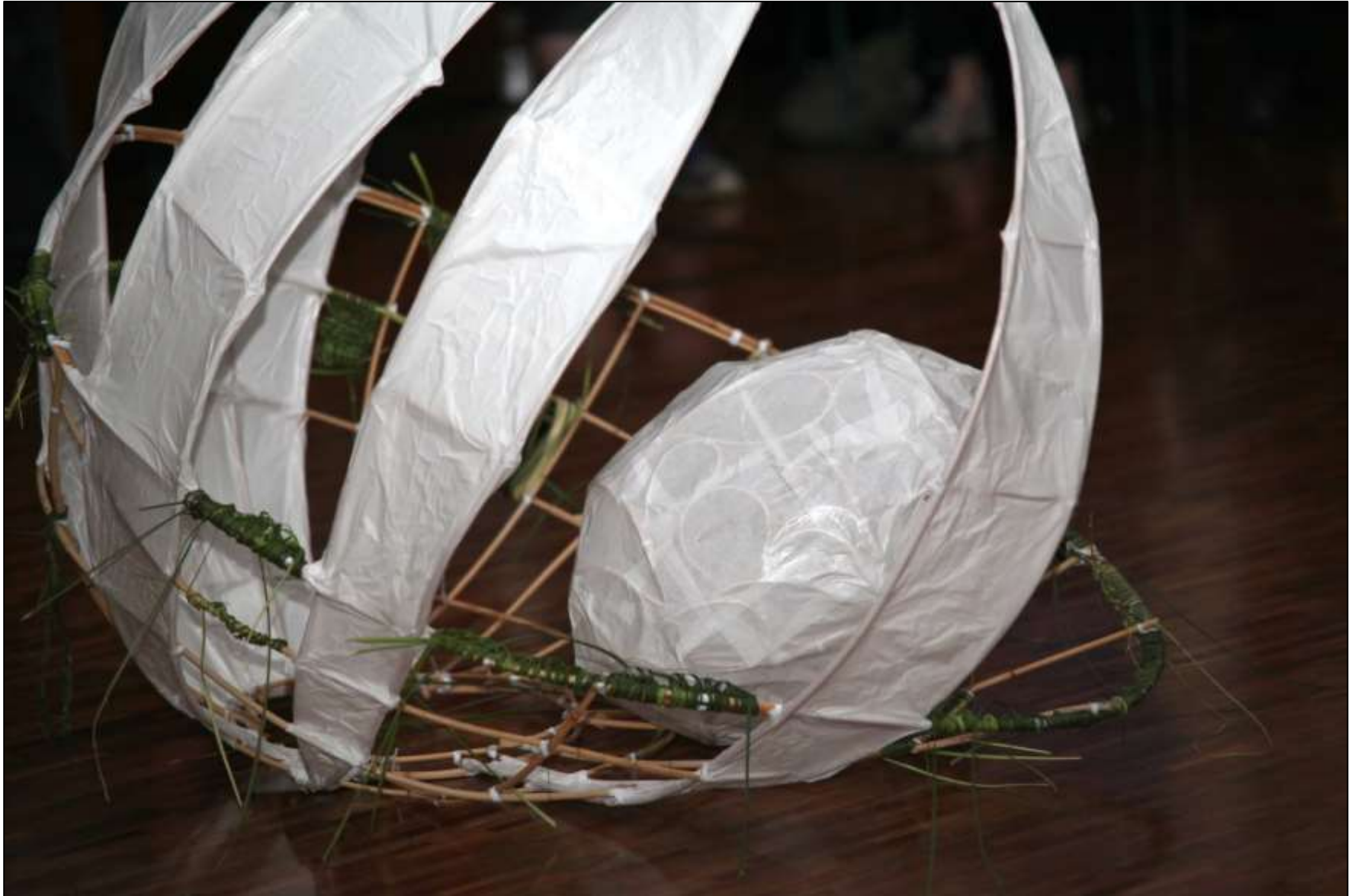
Shearwater Nest and Egg