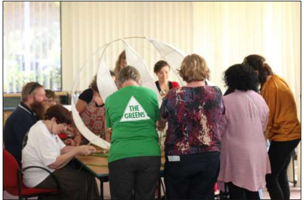
Weaving the Shearwater Nest with stories and language