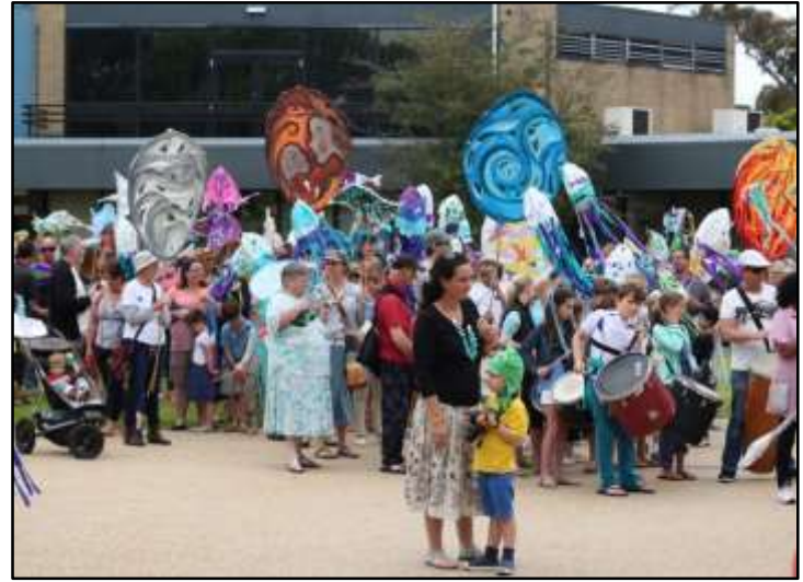
Assembling in the Cowes Town Square