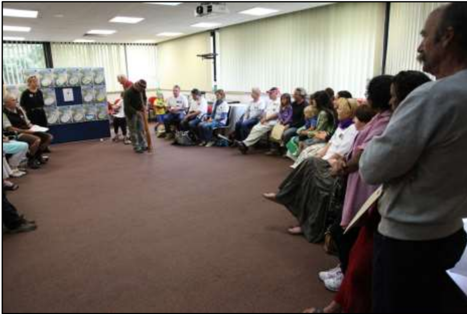
Induction of Volunteer Team