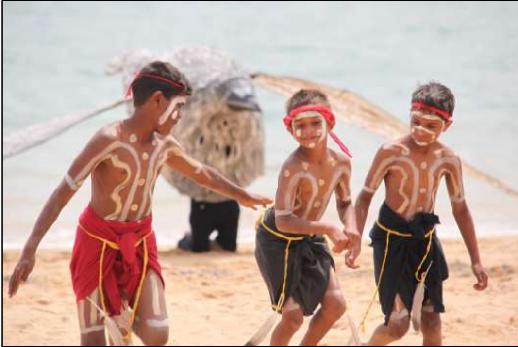
Baarny Bubup Water Babies